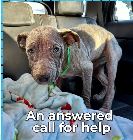
An answered call for help