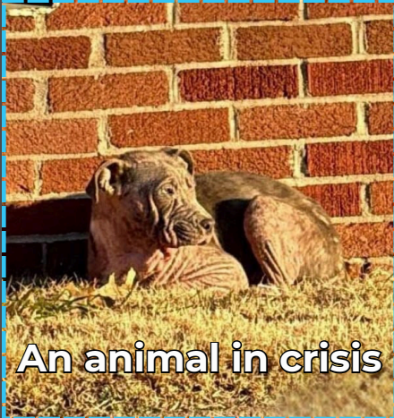
An animal in crisis