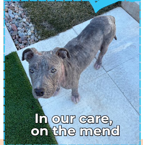
In our care, on the mend